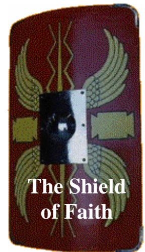
The Shield of Faith